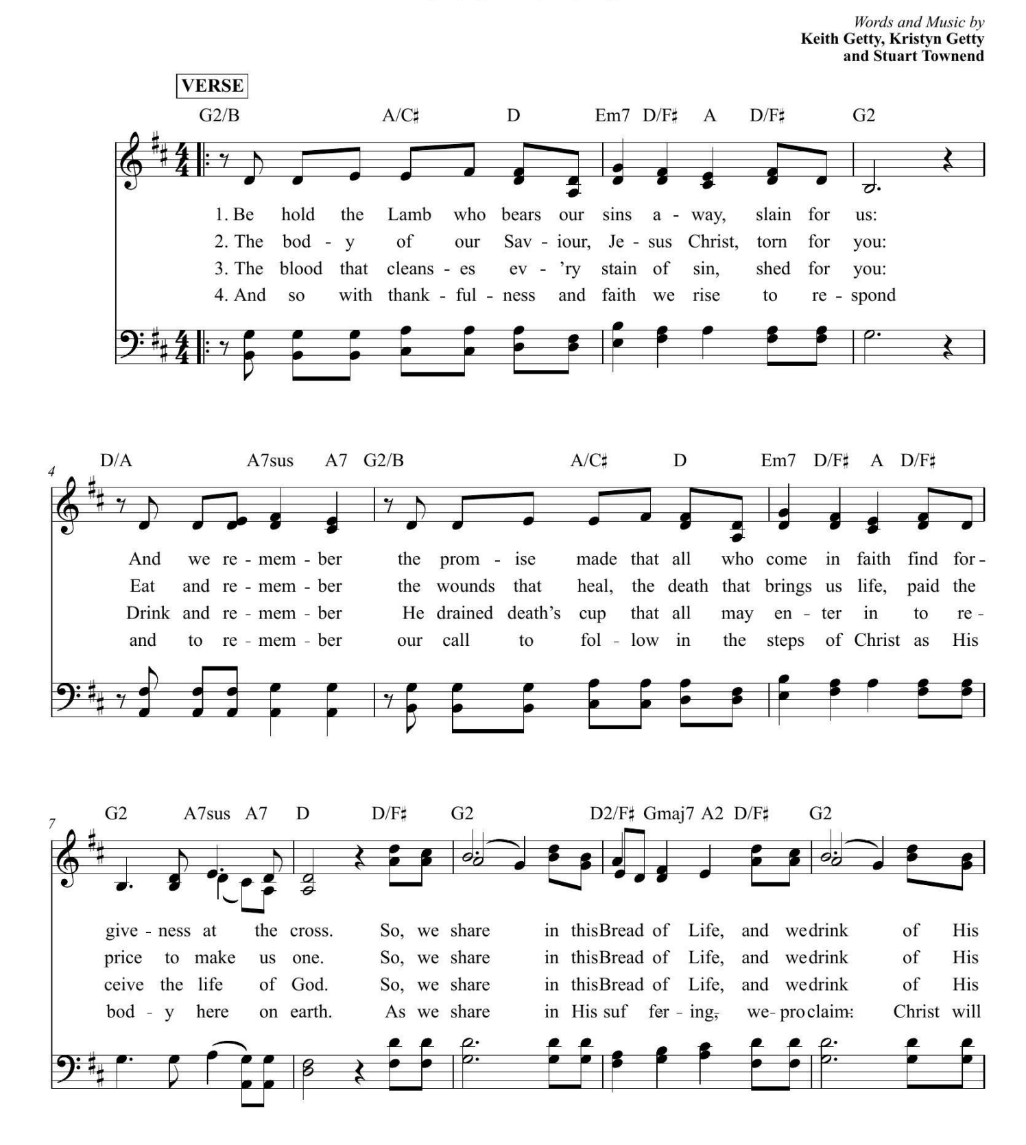
CCLI Song # 5003372 © 2007 Thankyou Music For use solely with the SongSelect® Terms of Use. All rights reserved. www.ccli.com CCLI License # 11313639